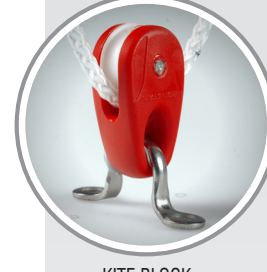
KITE BLOCK on Saddle