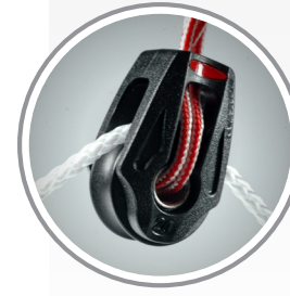
RF25109 on Lashing