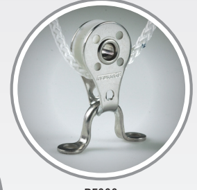
RF666 on Saddle