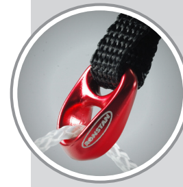
SHOCK on 8mm webbing