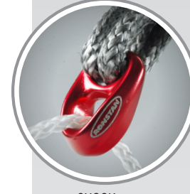
SHOCK on Dyneema® Link