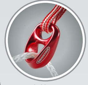
SHOCK on Lashing