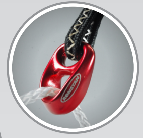
SHOCK on 'Pigtail'