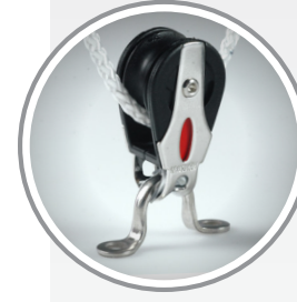
RF20101 on Saddle