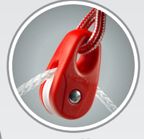
KITE BLOCK on Lashing