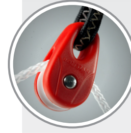
KITE BLOCK on 'Pigtail'